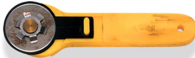
WORLD'S FIRST ROTARY CUTTER

OLFA cutters are used in the home and workplace internationally and like all other knives they must be handled with care. The following presentation is a guide for knife safety for all different styles.